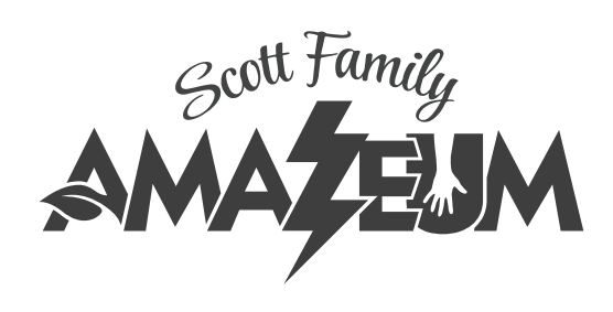
1 Color B/W Logo for Screenprint & Embossing