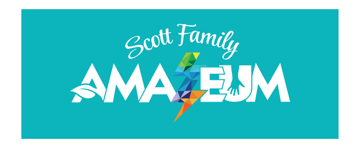
Reversed Logo with Playful Bolt